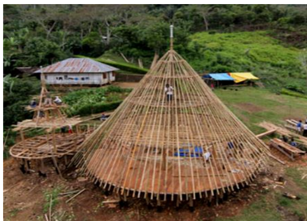
Figure 5: Mbaru Niang Development Process