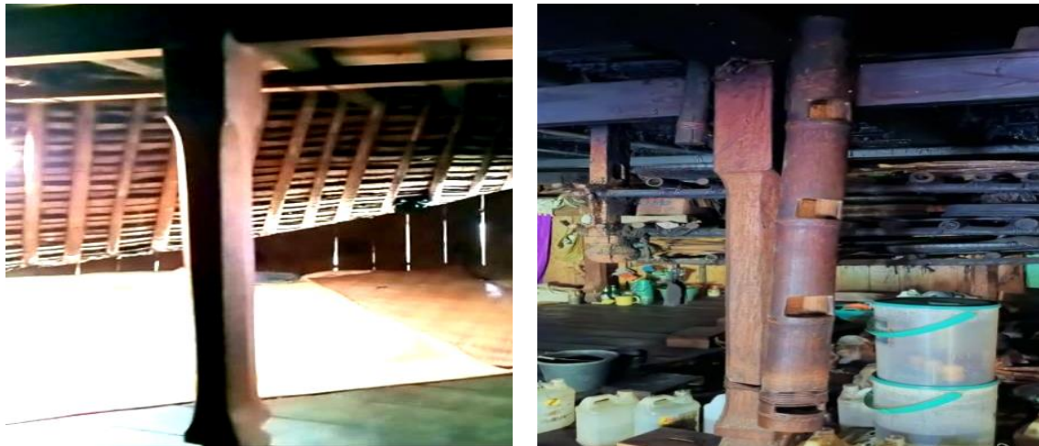
Figure 2: The pillars of the Mbaru Niang and Hiri Bangkok traditional houses (middle pillar)