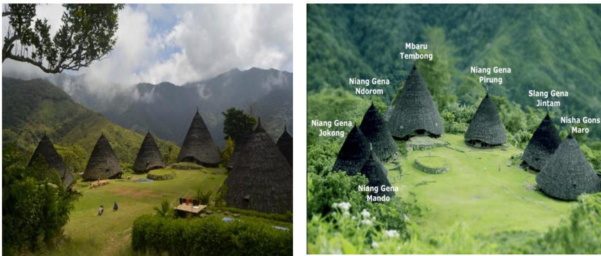
Figure 1: Mbaru Niang traditional house and its name

Wae Rebo is a traditional village that has a unique culture. This research was conducted in the village of Wae Rebo, Manggarai. Wae Rebo is a traditional village located in the highlands of Manggarai. Mbaru Niang comes from two words, namely "Mbaru," which means house, and "Niang," which means cone-shaped. Thus, Mbaru Niang is a conical house. Furthermore, there are seven Mbaru Niang in Wae Rebo Village, one of which is a traditional house or in the local language called Mbaru Tembong/Mbaru gendang because, in this house, there are stored heirloom objects such as gongs, drums, and other objects used at the time of traditional ceremonies. While the other six Mbaru Niang are called Niang Gena (ordinary houses). The residents of Mbaru Gendang are representatives of each of the descendants of Wae Rebo's ancestors, totaling 8 families. Furthermore, 6 Niang Gena is inhabited by 6 to 7 families. In addition, Niang Gena is also used as a lodging house for guests and tourists visiting Wae Rebo.