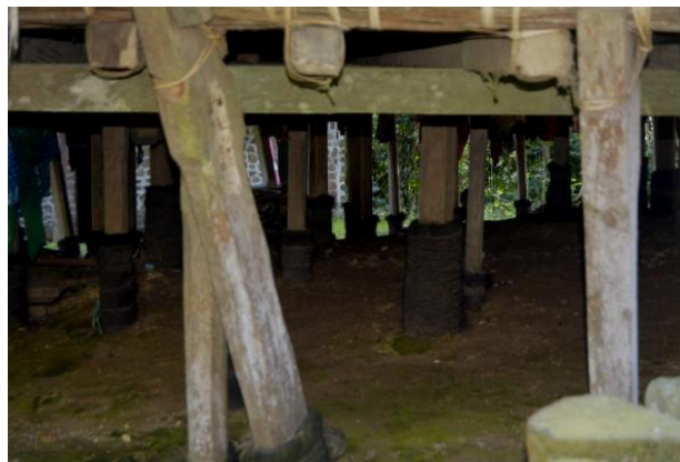
Figure 3: Pole under Mbaru Niang

Mbaru Niang's foundation is composed of Hiri Haung (pillars under the house) using Worok wood (one of the hardwoods that grow in the forest around Wae Rebo).